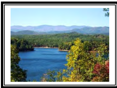
Captions Autumn days at Lake James, NC.