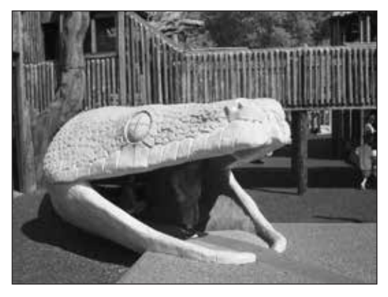
The snake head at the Nashville Zoo inspires children to move around in a slithering motion.

animal locomotion while providing the language of geometry to extend and support their understandings.