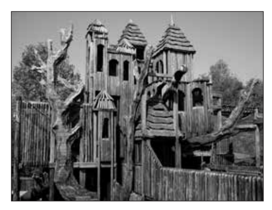
Children find interesting ways to climb up the Nashville Zoo's Jungle Gym.