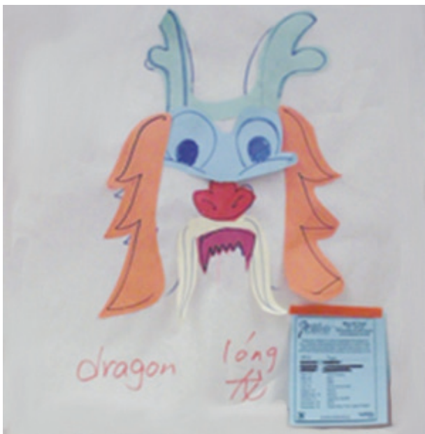
Figure 1. Dragon labeled in English and Mandarin.

Let children and families “hear” and “feel” the presence of cultural awareness and appreciation in your early childhood program or center by posting greetings from around the world in your welcome area. Saying “hello” from around the world is a fun way to greet children and parents! (Figure 2).