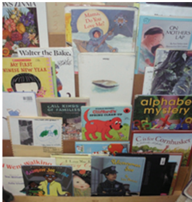
Figure 4. An example of a classroom library with a diversity of books representing multiple elements of diversity.

As you consider implementing activities and interactions that support young children's learning and development, don't forget culture matters!