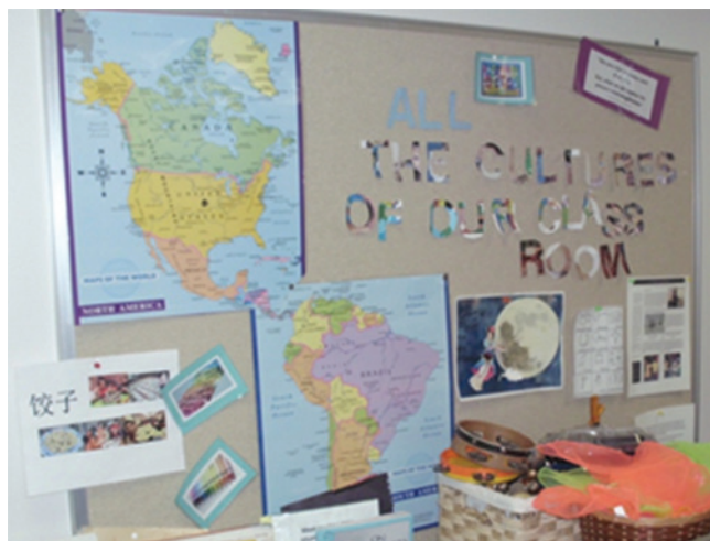
Figure 3. Classroom learning station highlighting diverse cultures.

Use your resources: Sometimes it can be overwhelming as a teacher to know where to begin to integrate cultural diversity for young children. Therefore, start first with the resources right in your early care program. This includes YOU! Figure 3 is an example of how one team of teachers created a learning station highlighting the diverse cultures of the students in the classroom. You could extend your learning station to include cultures beyond your own and the children you serve by brainstorming with children and families about the popular ethnic foods you have in common or cultures of interest.